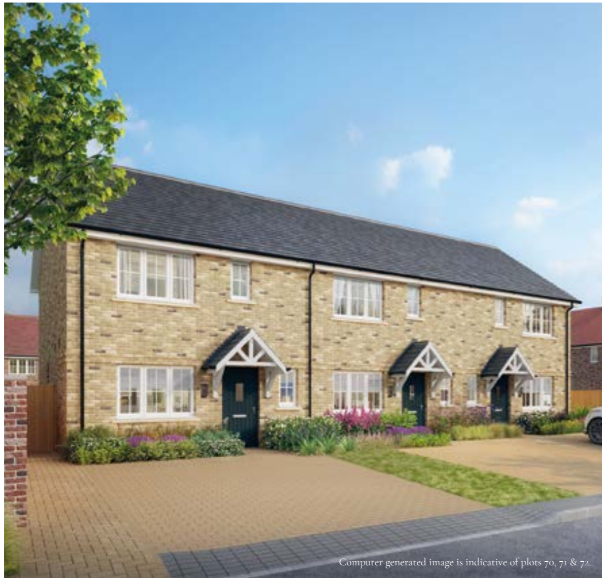
Computer generated image is indicative of plots 70, 71 & 72.