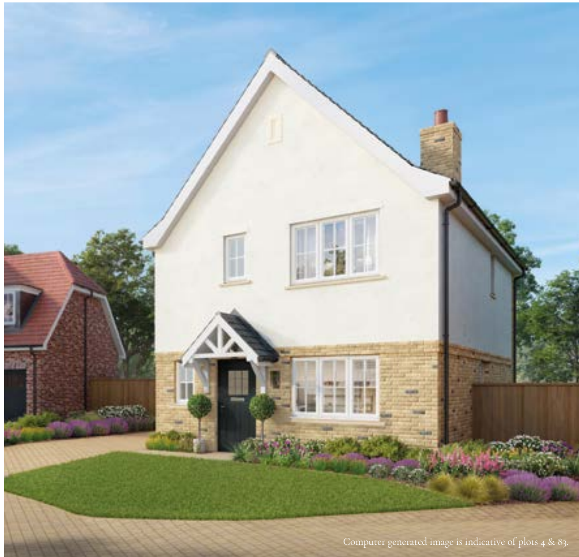
Computer generated image is indicative of plots 4 & 83.