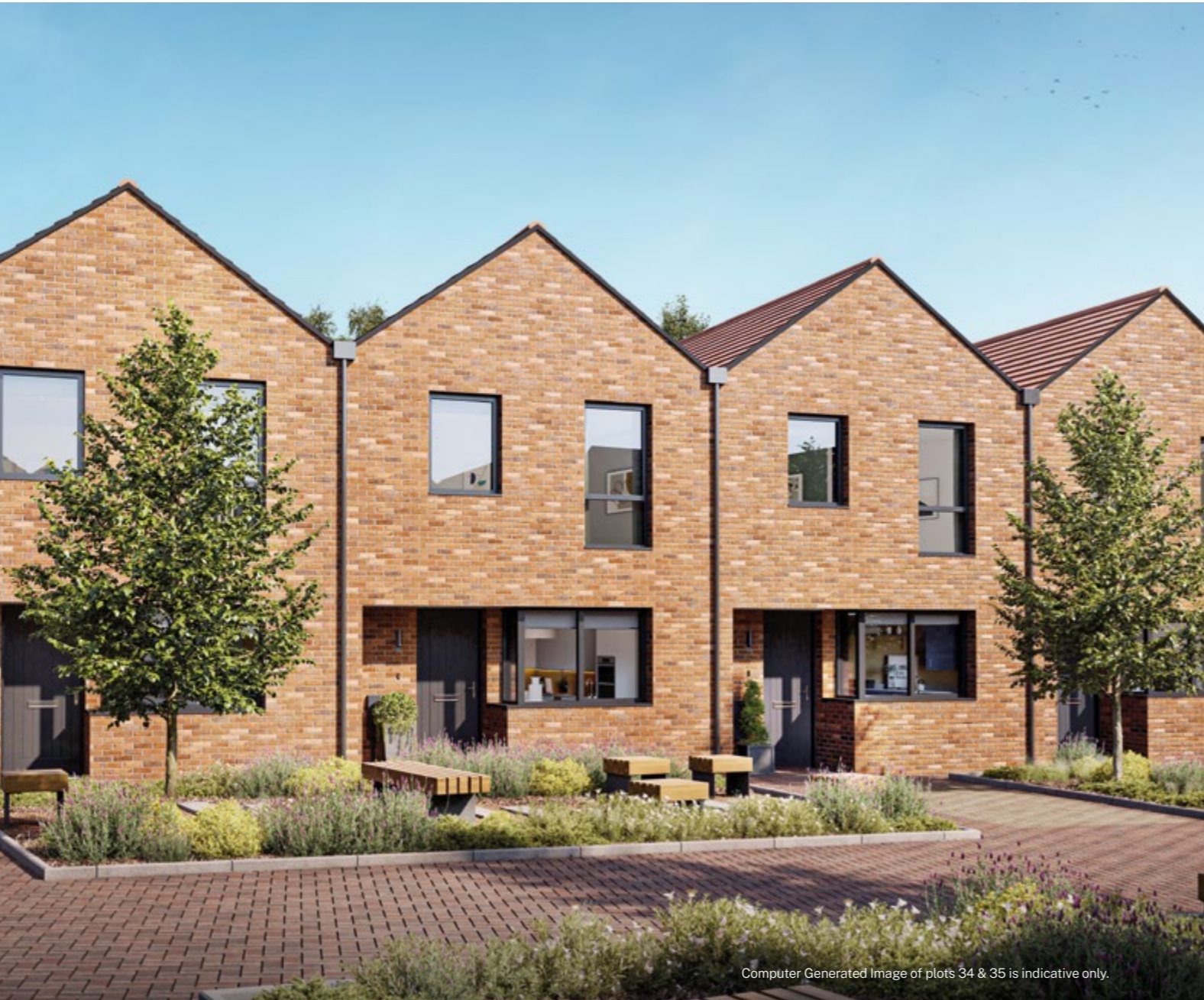
Computer Generated Image of plots 34 & 35 is indicative only.

PLOTS 32, 33, 34, 35, 36, 37*, 38, 39*, 40, 69*, 70*, 71*, 72*, 73* & 75