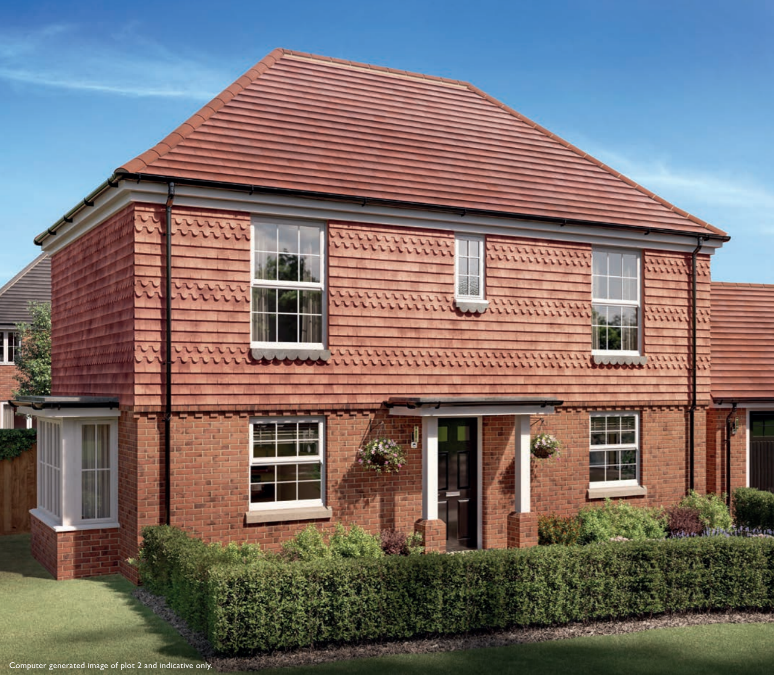
Computer generated image of plot 2 and indicative only.