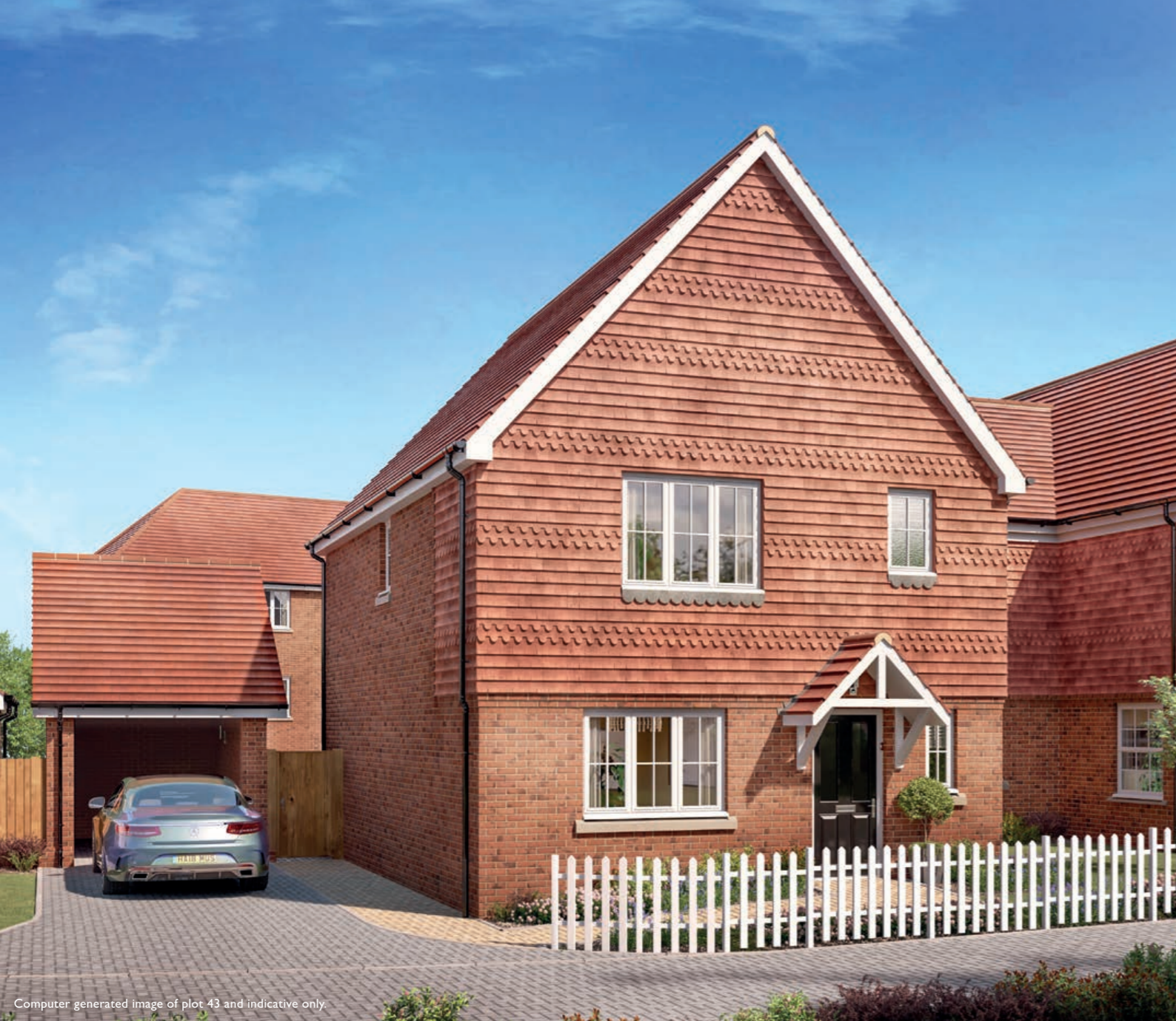
Computer generated image of plot 43 and indicative only