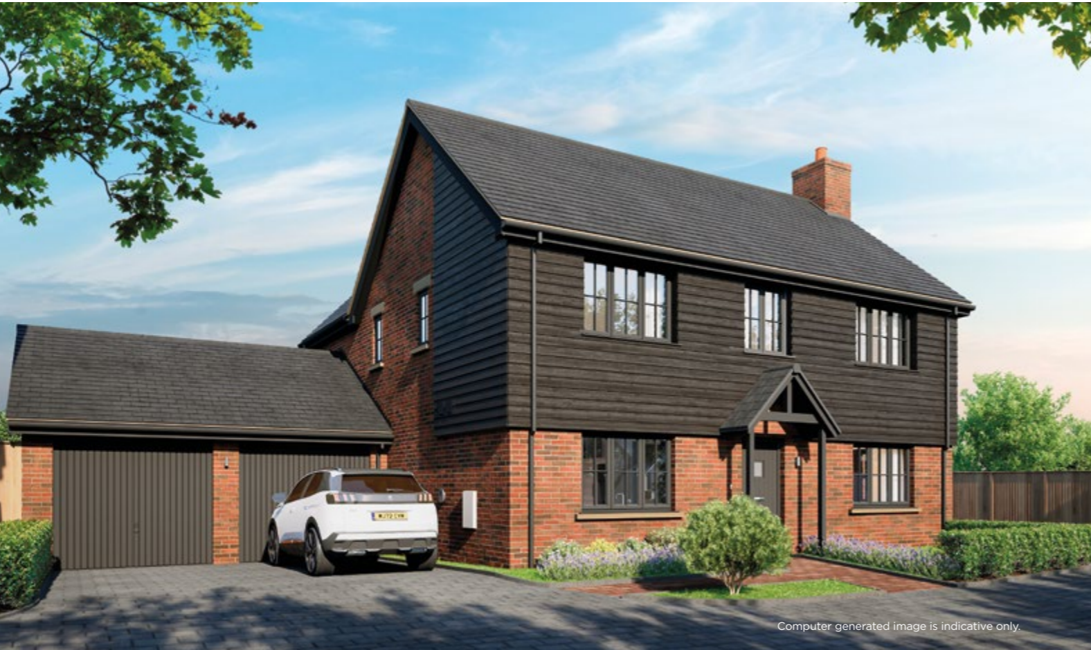
Computer generated image is indicative only.