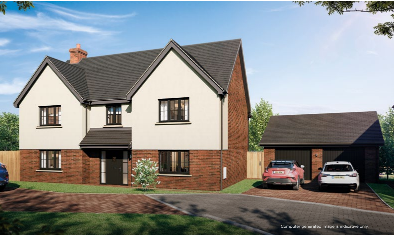
Computer generated image is indicative only.