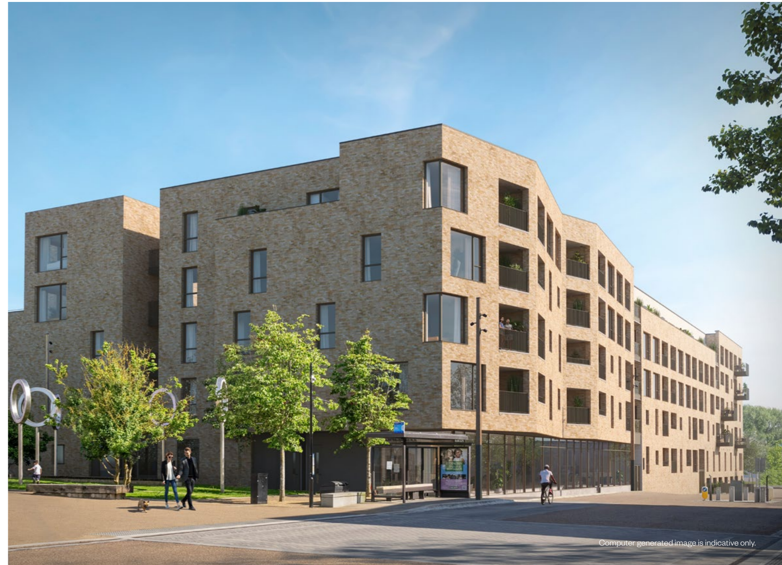
Computer generated image is indicative only.

◄► = Measurements C = Cupboard W = Wardrobe U/S = Utility/Store cupboard W/D = Washer/Dryer HR = MVHR R = Riser cupboard □ = Indicative wardrobe position