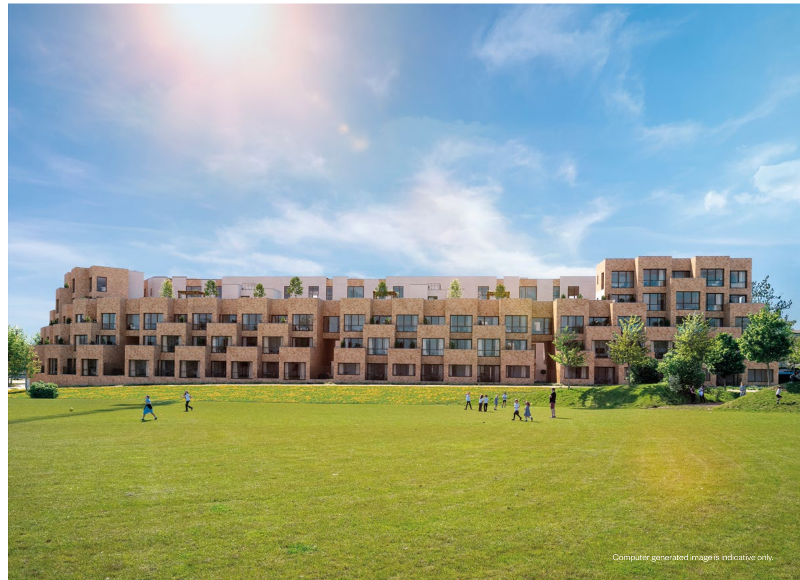
Computer generated image is indicative only.

◆ = Measurements C = Cupboard W = Wardrobe U/S = Utility/Store cupboard W/D = Washer/Dryer HR = MVHR R = Riser cupboard □ = Indicative wardrobe position ✱ = Platinum Specification